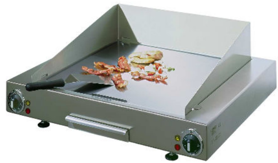
BG SF 70 A