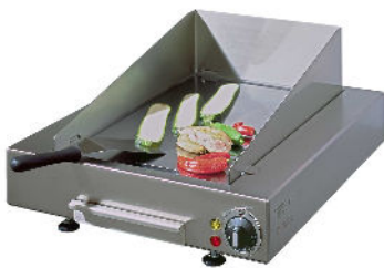
BG SF 50 A