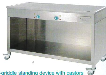
TEPPANYAKI-griddle standing device with castors