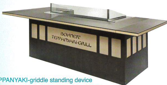
TEPPANYAKI-griddle standing device As mobile module in frontcooking station

Easy and quick cleaning (also in between grilling sessions) just with water and a special sponge, saves valuable worktime and all chemicals.